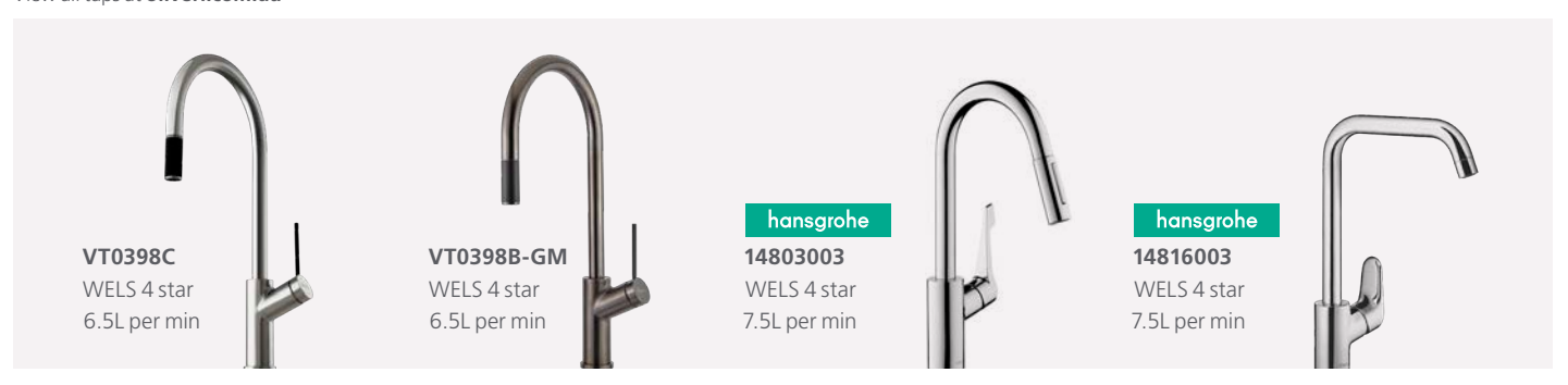
Taps/ View all taps at oliveri.com.au

590\text{w}\times470\text{h}\times235\text{d} / 45\,\text{Litretub bowl}