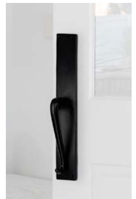
Small plate handle