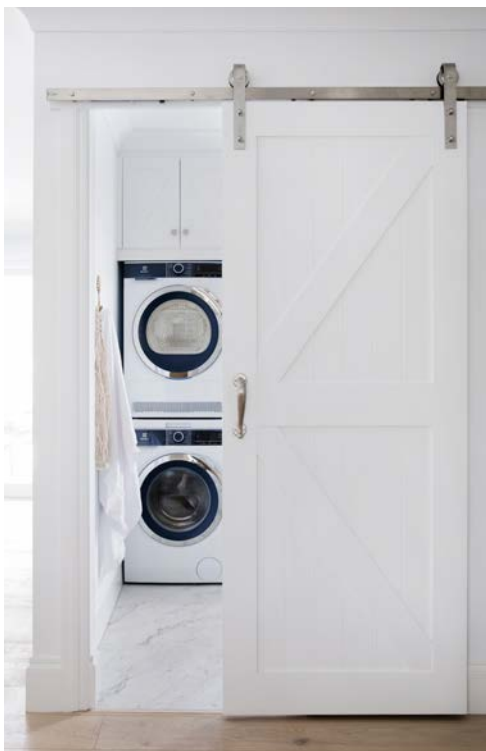
AR43B with HABARNCLSS track

Our barn doors can be tailored to suit the style of a home, whether that's rustic with traditional wood, or painted to provide a more modern look.