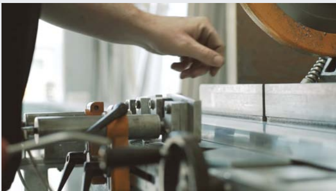
NZ Workshop Aluminium process

Our products are hand-crafted in Wanganui, in the North Island of New Zealand. But it's not only about the craft – We have timber options from FSC and PEFC certified sources, and our aluminium doors are made from the 'greenest metal on earth'.