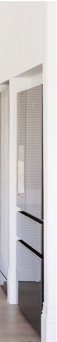
Louvre full closed blade