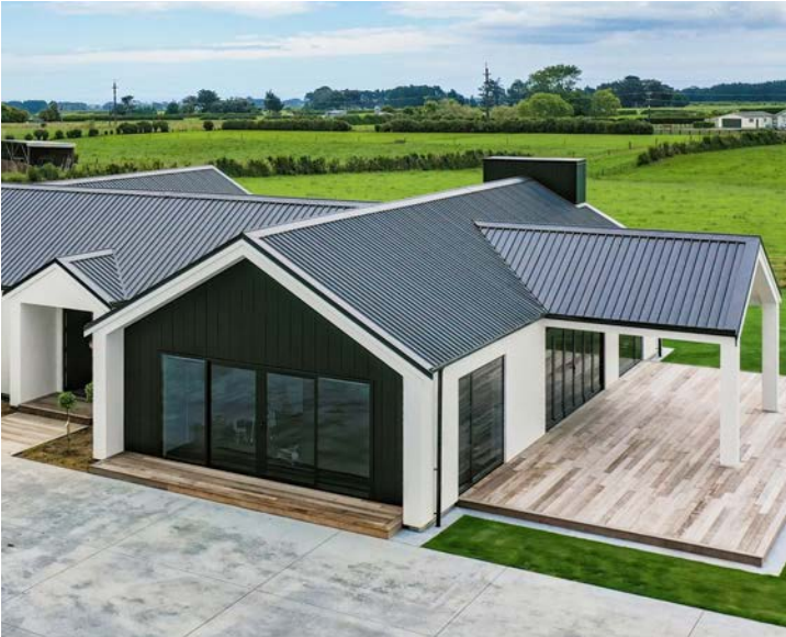
Custom powder coating allowed Alyssa to match the home's external door, the HV3, with the home's aluminium windows and its roof.