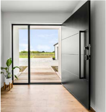
"The door's thermally-enhanced properties reduce condensation, and work with the new H1 requirement."