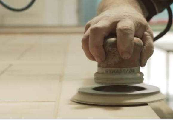
NZ Workshop Timber process