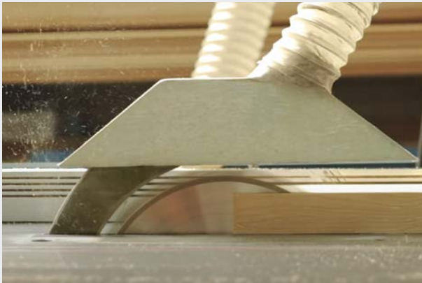
NZ Workshop Timber process