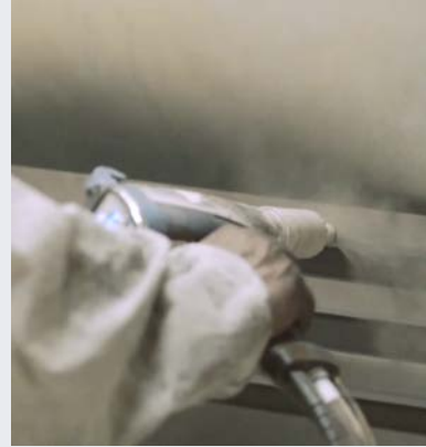
NZ Workshop Aluminium process