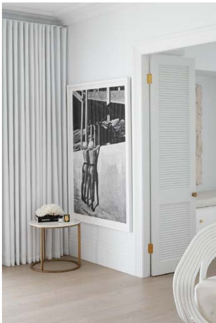
Louvre full open blade