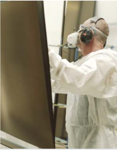
NZ Workshop Aluminium process