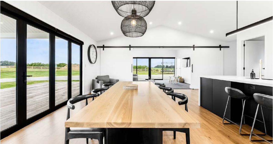
The project's refined, modern, and minimalistic colours and textures matched perfectly with Parkwood Doors.