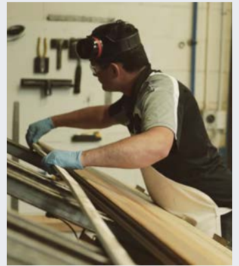
NZ Workshop Timber process