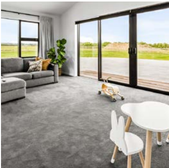
"The contemporary look of the HV3, and its horizontal lines, complemented the home's other surfaces."