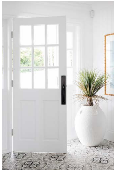
Small plate handle

We complement our doors with hardware that completes your entranceway, from popular grip-sets to modern pull handles and lock sets. We can also machine out space for your lock, saving you the hassle and risk of machining on site.