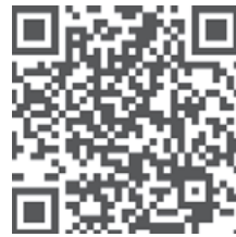
Sustainability / LEED