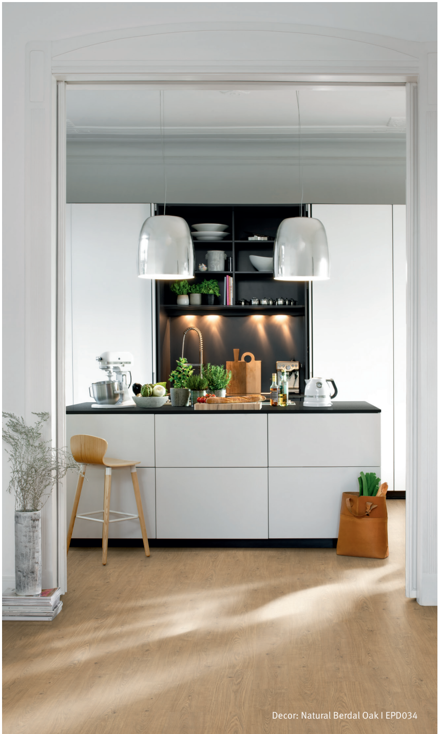
Decor: Natural Berdal Oak | EPD034