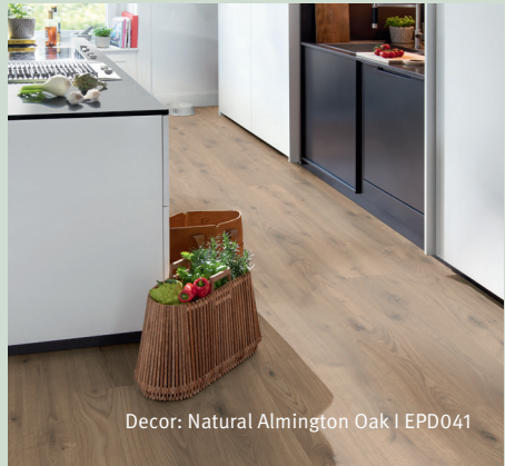
Decor: Natural Almington Oak | EPD041

The exterior is in no way inferior to the inner values: The authentic wood or stone look makes our Design Flooring GreenTec a natural eye-catcher in every room.