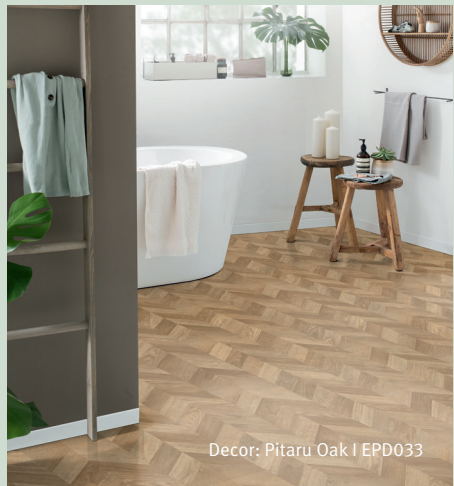
Decor: Pitaru Oak | EPD033