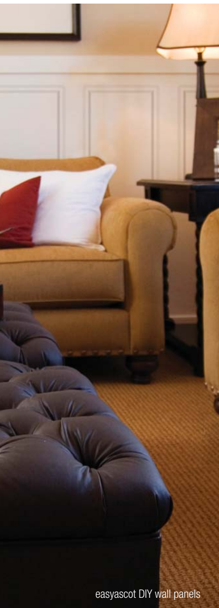
easyascot DIY wall panels