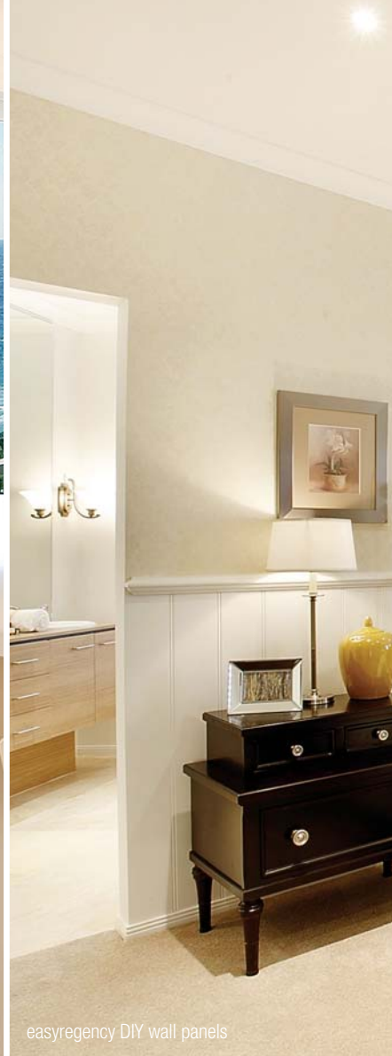
easyregency DIY wall panels

With the easycraft range of DIY dado height wall panels you can transform a room in a weekend. From the classic styling of the easyascot, the country feel of easyregency or the contemporary looking easyvj, you have a range that can deliver exactly the look and feel for any room in your home.