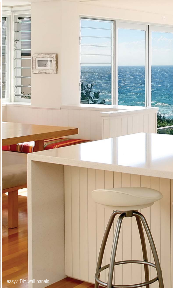
easyvj DIY wall panels