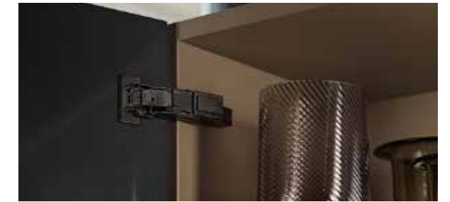
CLIP top BLUMOTION applications for thin doors

Detailed information on the awards: www.blum.com/award