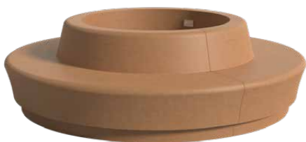
2640 Alfresco (Three 1/3 Sections) ○ ALF262675 D 2640 x H 755 mm 730kg Approx Weight 0.89 m 3 Approx Volume