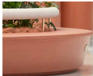
Upholstered seating inserts available as a timber alternative to Alfresco and Bondi. Discuss your requirements with our sales team.