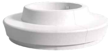
2640 Alfresco (Three 1/3 Sections) ○ ALF262675 D 2640 x H 755 mm 730kg Approx Weight 0.89 m 3 Approx Volume