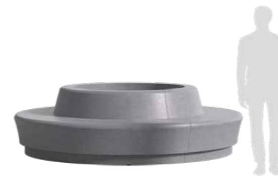
2640 Alfresco (Three 1/3 Sections) ○ ALF262675 D 2640 x H 755 mm 730kg Approx Weight 0.89 m 3 Approx Volume