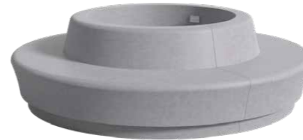
2640 Alfresco (Three 1/3 Sections) ○ ALF262675 D 2640 x H 755 mm 730kg Approx Weight 0.89 m 3 Approx Volume