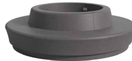
2640 Alfresco (Three 1/3 Sections) ○ ALF262675 D 2640 x H 755 mm 730kg Approx Weight 0.89 m 3 Approx Volume