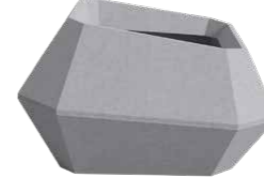
Tapered Configuration CODE B