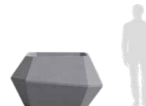
Flat Configuration CODE A