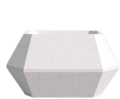
1200 Gem Planter GEM12 L 1200 x W 1200 x H 650 mm 150kg Approx Weight