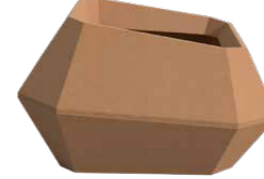
Tapered Configuration CODE B