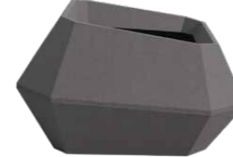
Tapered Configuration CODE B