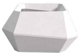
Flat Configuration CODE A