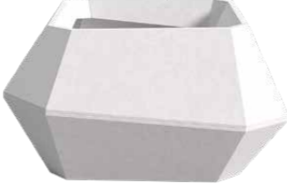
1500 Gem Planter GEM15 L 1500 x W 1500 x H 900 mm 190kg Approx Weight