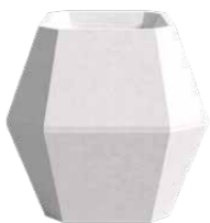
1000 Gem Planter GEM10 L 1000 x W 1000 x H 1000 mm 150kg Approx Weight