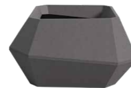
Flat Configuration CODE A