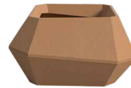
Flat Configuration CODE A