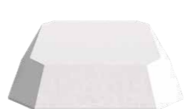
1200 Gem Seat GEM12ST L 1200 x W 1200 x H 325 mm 90kg Approx Weight