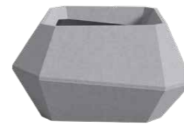
Flat Configuration CODE A