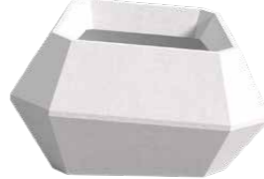
Perpendicular Configuration CODE C