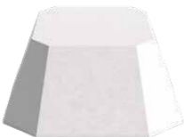
1000 Gem Seat GEM10ST L 1000 x W 1000 x H 500 mm 80kg Approx Weight