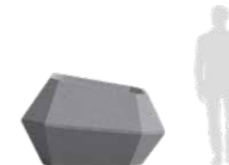
Tapered Configuration CODE B