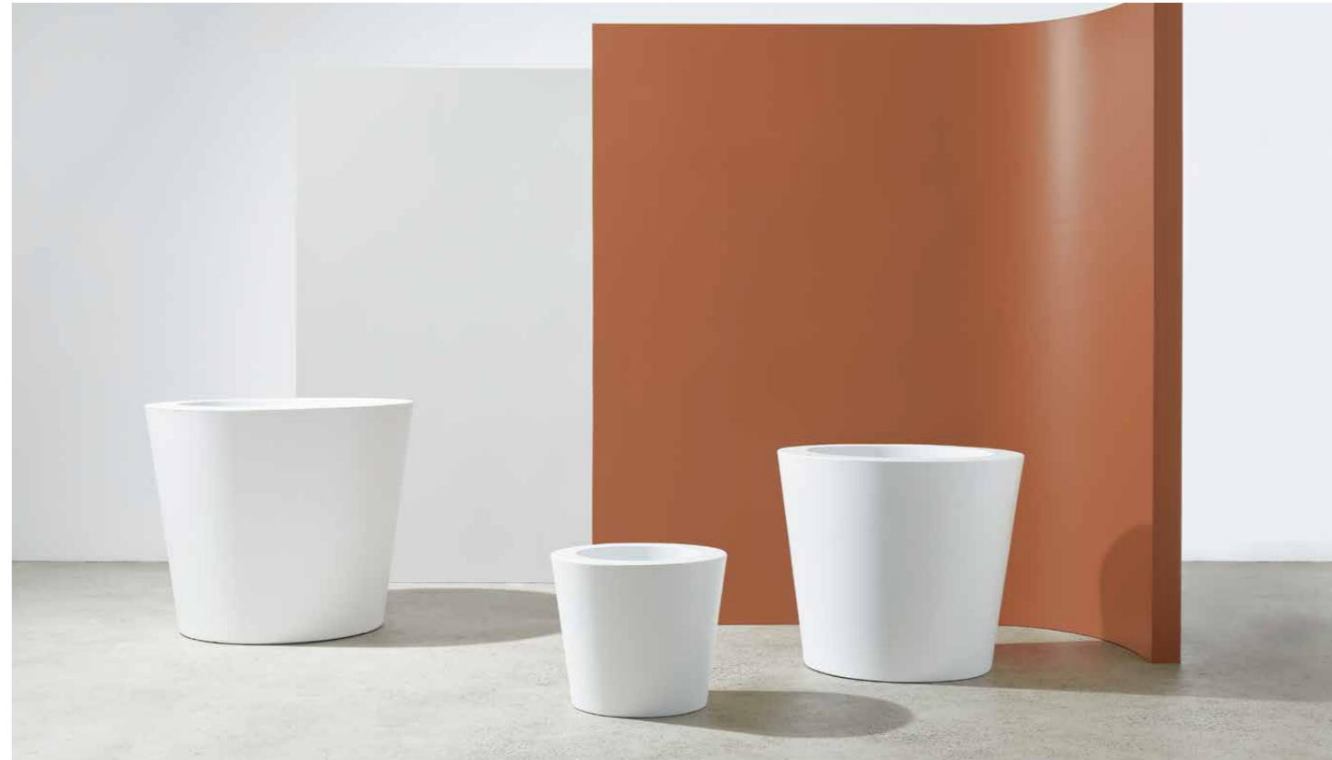
Photograph features our Konika collection with a custom white painted finish.