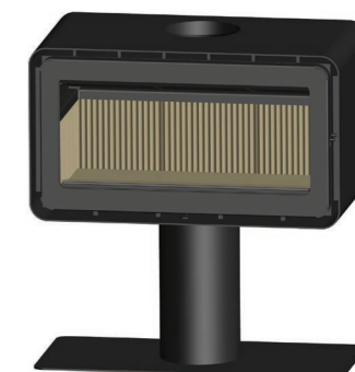
Hayra 85P Freestanding Pedestal