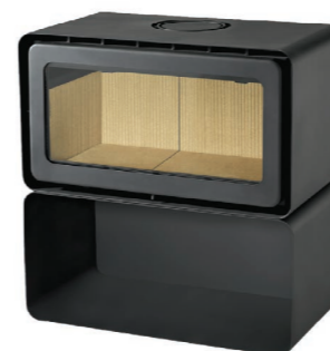
Hayra 85L Freestanding includes base (optional fan)