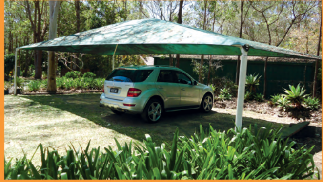
"15 Year old Z16 fabric conquers the harsh Queensland climate, installed in the Brisbane suburb of Capalaba".

Rainbow Shade submitted fabric samples to two independent accredited testing agencies. Breaking force, tear resistance and UV protection tests were conducted. The results which came back from the 15 year old fabric testing are remarkable.