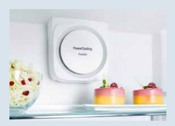
PowerCooling: A high-performance system that allows freshly stored items to be chilled rapidly while maintaining an even temperature throughout the interior. In this energy-efficient BluPerformance range, the fan switches off when the appliance door is opened, saving valuable energy.

The SBSes 8484 Side-by-Side fridge-freezer from the BluPerformance series combines plenty of storage space with perfect cooling performance for long-lasting freshness. This unit can be precisely controlled via the touch electronics system with digital temperature display. Meanwhile BioFresh-Plus allows added storage flexibility and a longer shelf life for fruits, vegetables, fish, meat, and dairy products. And thanks to Liebherr's innovative NoFrost technology, the appliance never has to be defrosted. With elegant and timeless design in combination with high-quality materials, components, and workmanship, this model will continue to catch the eye for many years to come.