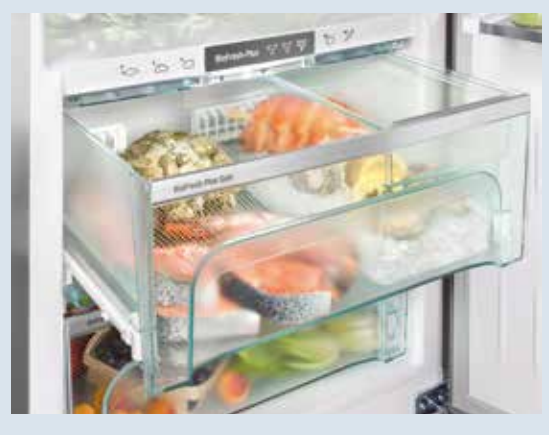
BioFresh-Plus: With the adjustable temperature range of 0°C and -2°C, BioFresh-Plus technology offers even more flexibility for your produce. The BioFresh-Plus drawer includes a versatile Fish & Seafood-Safe.