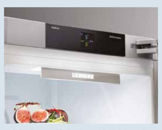
2.4" Touchscreen Display: Located behind the appliance door, this high-resolution and high-contrast 2.4" touchscreen display can be read from any angle. Stored menu options are Intuitive and easy-to-operate.