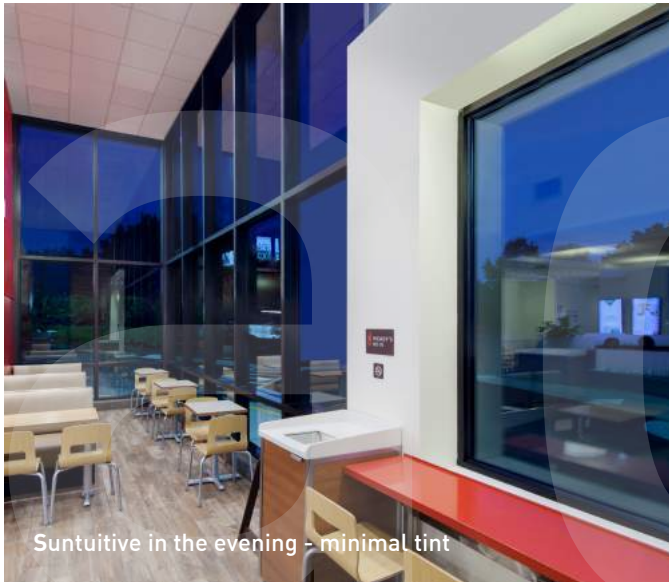
Suntuitive in the evening - minimal tint