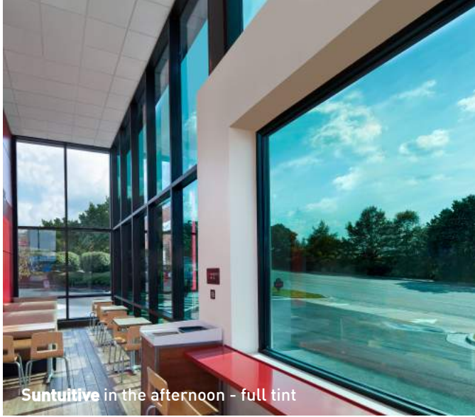
Suntuitive in the afternoon - full tint