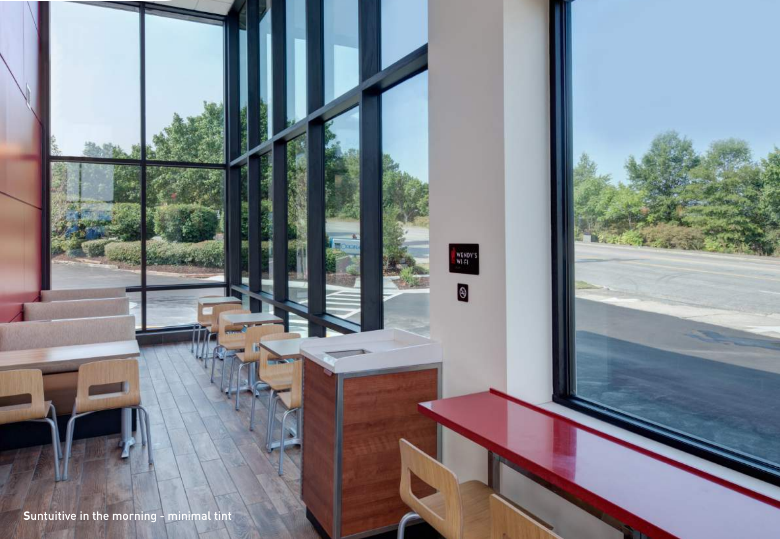
Suntuive in the morning - minimal tint

The unique ability to use the sun's own energy to automatically tint the window as required results in remarkable energy savings and makes it the perfect fit for sustainable building design. Suntuive combines perfectly with the best low-E glass and is able to assist with Green Star project ratings.